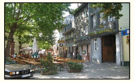
Sachsenhausen; Image supplied by Arie Hordiik

A Divine Love retreat is planned for August 31 - September 4, 2016 in Frankfurt, Germany only half an hour's drive from the Frankfurt International Airport. A number of rooms and conference rooms have been booked at a good rate in Maingau hotel which is in a quieter location. In its vicinity, in one of the most popular parts of Frankfurt called Sachsenhausen, there is a large variety of bistros, restaurants, and small shops in price categories to suit all budgets. Within walking distance, visitors can enjoy a stroll along either bank of the river Main, visit one or more museums, and go to a concert or the theatre. Frankfurt has excellent public transport connections. For more information, visit the DLSF forum.