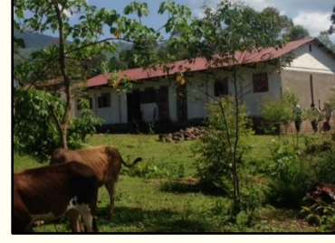
Bathing/latrine facilities and cooking/food storage building

More about LITA's projects and activities as well as donation information can be found in their newsletter.