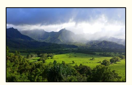
Hanalei Lookout